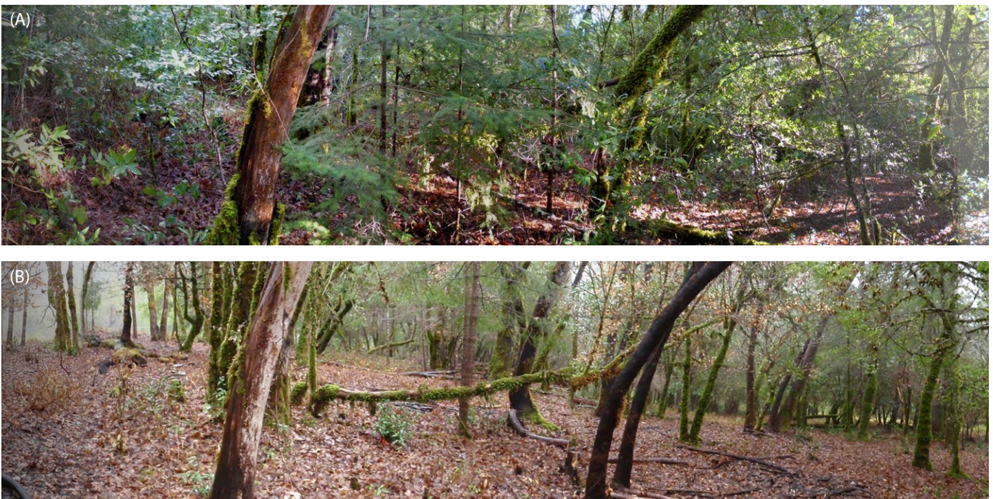
Figure 2. Before (A) and after (B) photographs from a fuel-reduction project in Humboldt County, CA.