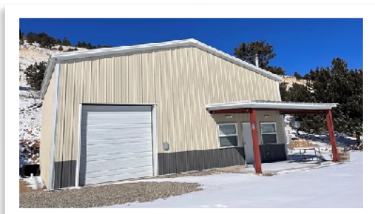
Steel utility structure buildings