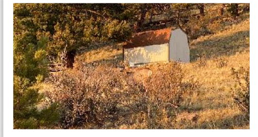
Standalone sheds or garages (Can have with home)