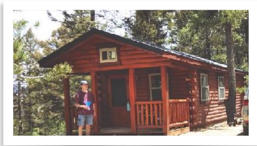
Park models or tiny homes